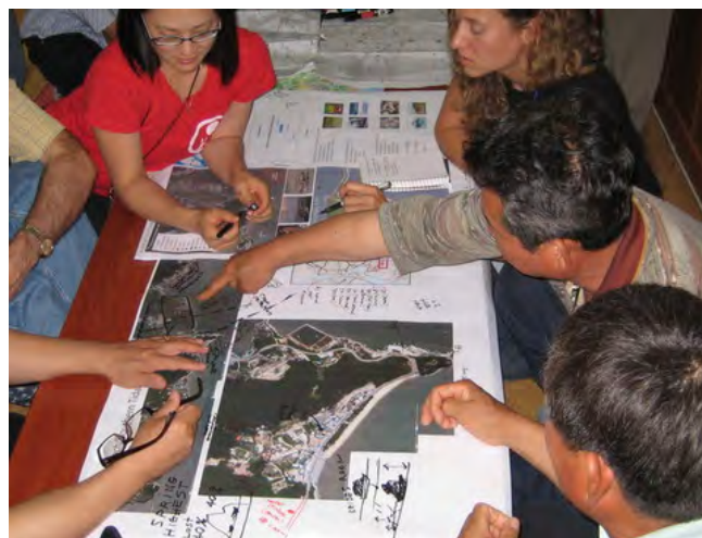
SAVE at Ganghwa