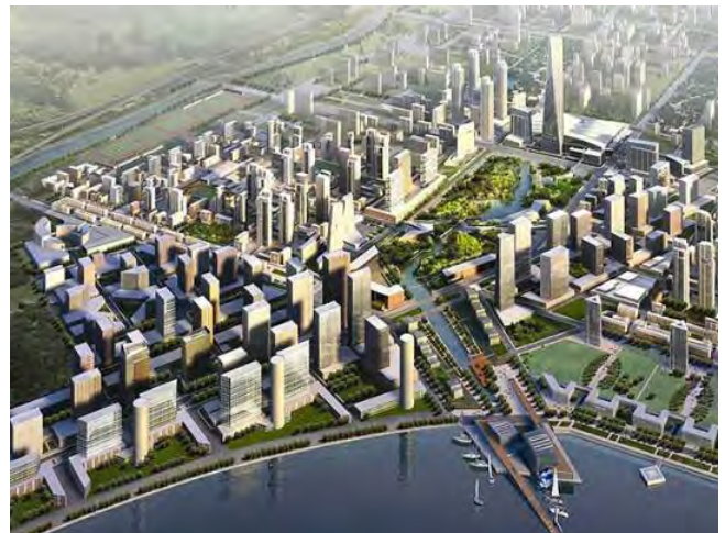
Promotional Rendering of Songdo International Business District