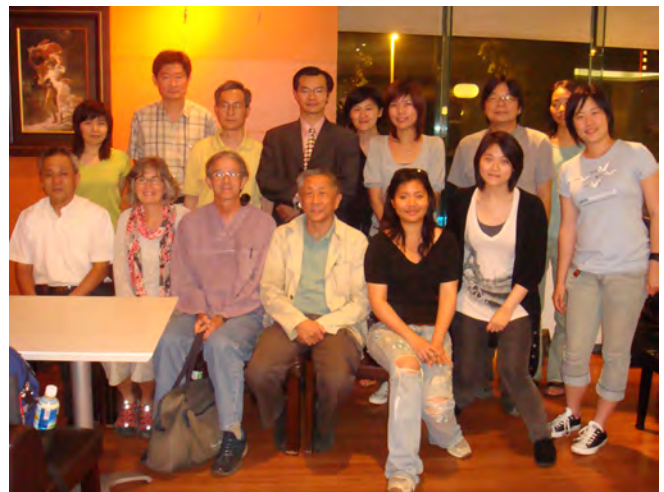
Dinner with local experts and government officials.